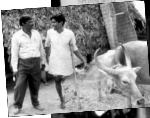
Taking care of livestock