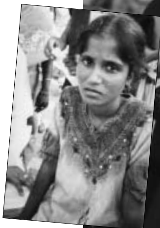
Young woman affected by leprosy, India.