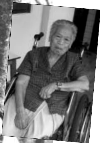
Elderly village resident, Thailand.