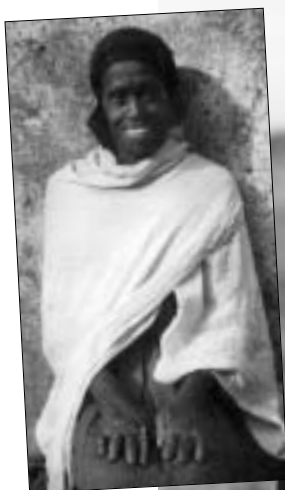
Somali woman cured of leprosy.